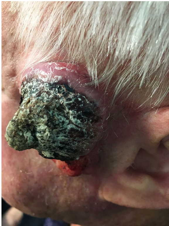
Fig. 1 Clinical appearance of the recurrent squamous cell carcinoma of the left temple with zygomatic bone metastasis