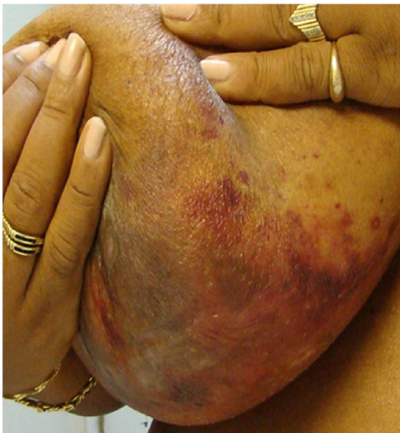
Figure 1 Extensive hemorrhagic bullae with desquamation and surrounding purpura in skin of both breasts, prior to treatment.